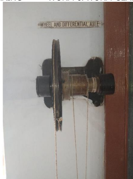
WHEEL & DIFFERENTIAL AXLE