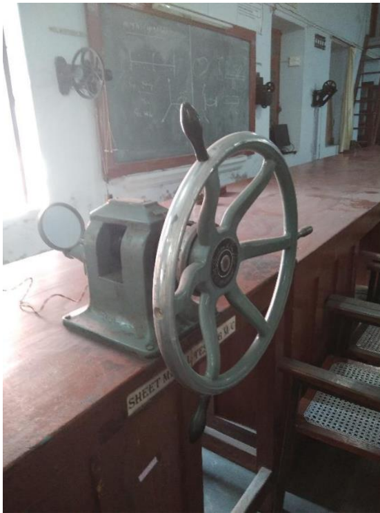
ERICHSEN CUPPING TEST