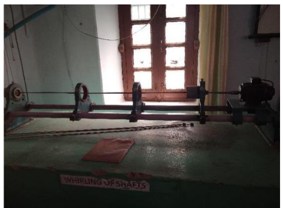
WHIRLING OF SHAFT