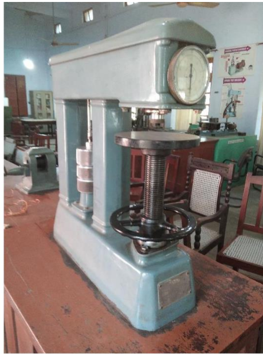
ROCKWELL HARDNESS TEST