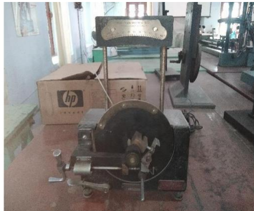
OLSEN STIFFNESS TESTER