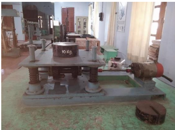
UNIVERSAL VIBRATION EXCITER