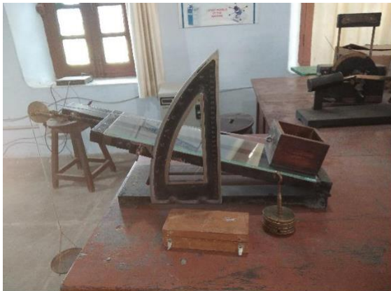
FRICTION ON INCLINED PLANE