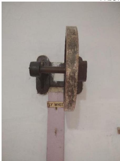
FLY WHEEL (MOMENT OF INERTIA)