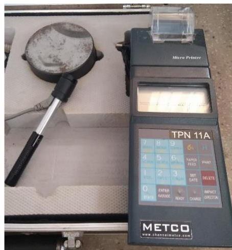
METCO PORTABLE HARDNESS TESTER