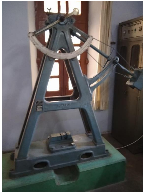
IMPACT TEST MACHINE