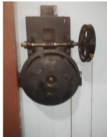
WORM & WORM GEAR