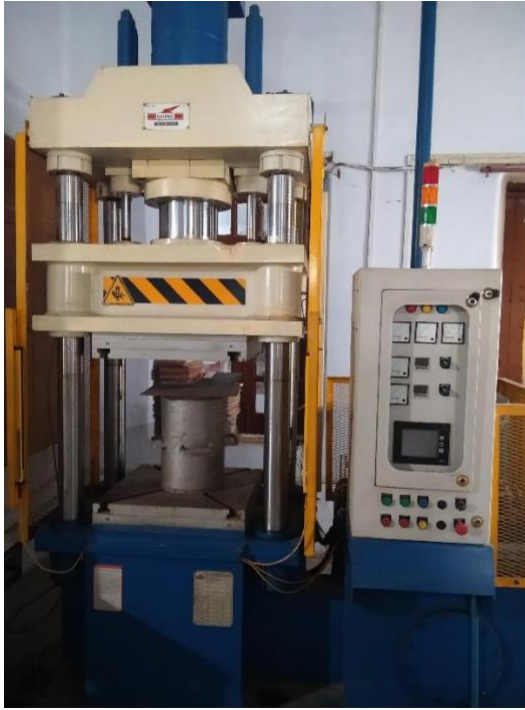
HYDRAULIC PRESS (100 TON)