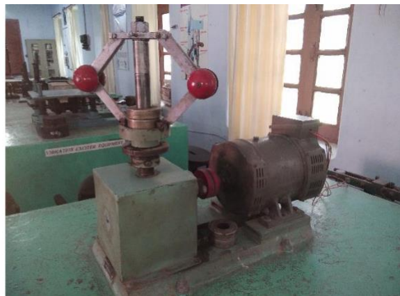
UNIVERSAL PORTER GOVERNOR